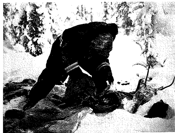
Figure 3.3 Gwich'in caribou harvest, Arctic National Wildlife Refuge near Arctic Village, Alaska. January 2007.

When a social-environmental engagement has lasted for more than six decades, it naturally becomes intergenerational. In a letter to U.S. Senator Daniel Akaka, young Gwich'in writer-activist Matthew Gilbert (2013, 484) poignantly illuminated the intergenerational attribute in the Arctic