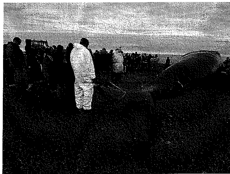
Figure 3.5 Prayer after an Iñupiat whale hunt to thank the Creator and the whale for offering food for the community. Barter Island, along the Beaufort Sea coast, Alaska, September 2001.