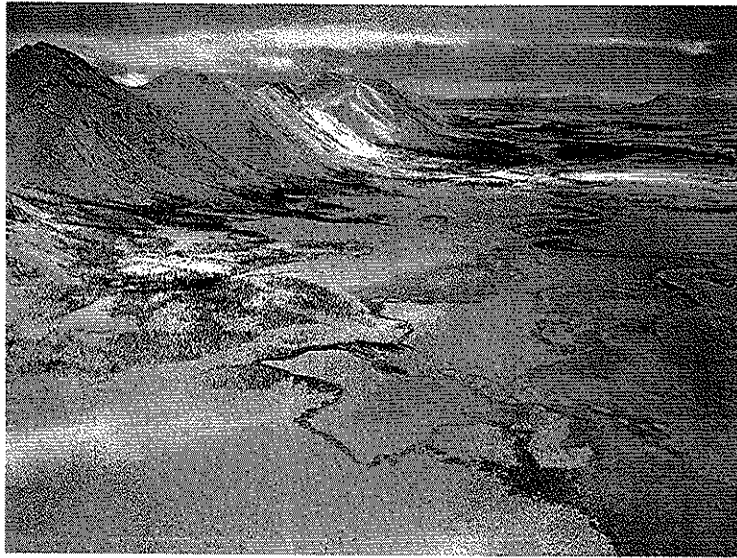
Figure 3.2 Sheenjek River valley, Arctic National Wildlife Refuge, Alaska. May 2002.

Today, that river valley, where James grew up, is a designated wilderness. So in a literal sense she indeed “learned by living out in” what is today a “wilderness.” But there is also an ethical interpretation that says that wilderness areas in the Arctic ought not to exclude Indigenous peoples, whose cultural and material subsistence critically depends on these lands and its resources. Not acknowledging habitation of the wilderness had been the case with the formation of the Arctic National Wildlife Range. Yet, as I became more and more engaged in the Arctic Refuge campaign and began to learn about its history, I came to realize that long environmentalism as practiced by people like James sustains itself over a long period of time and is able to accommodate multiple perspectives, in large part through the act of sincere listening—unlike the insincere listening that I witnessed at the Fairbanks Listening Session.