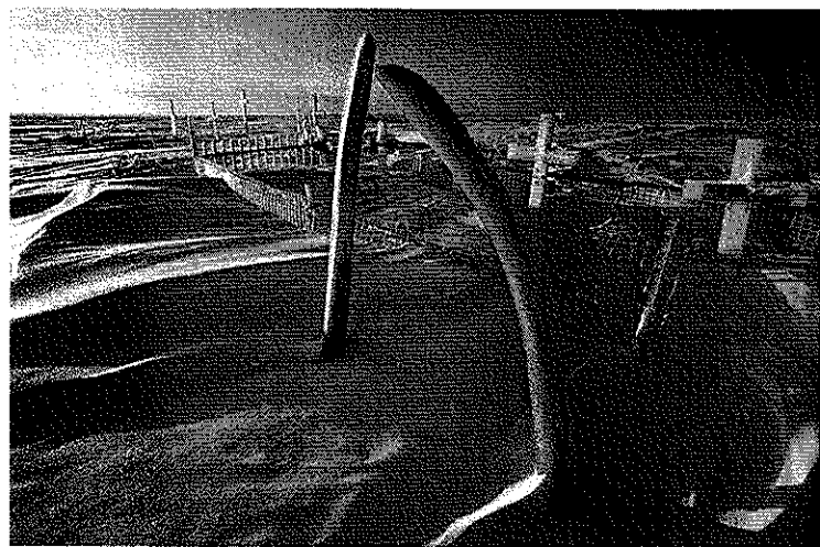
Figure 3.4 Iñupiat cemetery marked by bowhead whale jawbones, Barter Island, along the Beaufort Sea coast, Alaska. November 2001.

A Deepwater Horizon -like blowout in the Arctic seas would be devastating, worse than what happened in the Gulf of Mexico in 2010 (Banerjee 2013). For a variety of reasons, drilling for oil and gas in the Arctic Ocean is likely the most dangerous industrial project on Earth, as there is no proven technology to clean up an oil spill from underneath sea ice in one of the harshest environments on the planet. Even during the open-water season, there is frequent fog and severe storms, as well as large ice floes—all of which would make effective clean-up very difficult, if not impossible. The Arctic is also warming at a rate of about two to four times the global average, which has significant impacts on the Arctic ecology and the Indigenous communities. Oil and gas drilling in the Arctic seas would only add further stress and devastation. For example, it would exacerbate Arctic warming from various pollutants that industrial operations would generate (Banerjee 2015a). Moreover, extraction of fossil fuel resources from the Arctic is “incommensurate with efforts to limit average global warming to 2°C” above the pre-industrial level (McGlade and Ekins 2015, 187–190). Despite all of these concerns, as well as the continued lack of comprehensive scientific understanding of the marine ecology in the Beaufort and Chukchi seas, the Obama administration granted Shell Oil the necessary permits to drill in the Chukchi Sea during the open-water season in 2015.